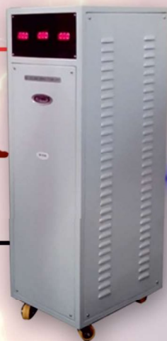
MG Servo Stabilizer